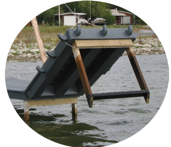
Design also useful for docks

For more information on dealers and pricing, please contact QMP (306) 242-4494 or lolenick@qmoplastics.com